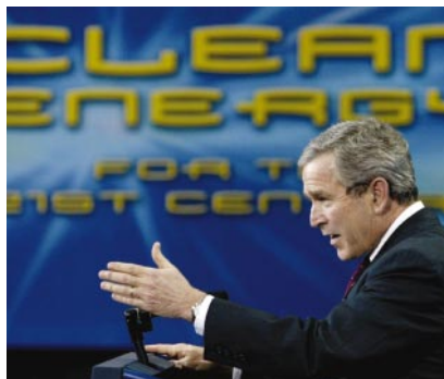
Clean getaway? George Bush has proposed funding to develop hydrogen-fuelled vehicles.

area of set-aside land. Even with a herculean effort on the model of the Apollo space programme, the hydrogen economy will arrive slowly, as it will require vast investment in infrastructure over a long period of time. This investment may not be driven by the market economy — it is more likely to evolve from a series of government energy-policy directives and legislative action that will mandate a blend of petroleum, methane, ethanol and hydrogen on the pathway to an eventual all-hydrogen transport supply. During this time there will certainly be a migration across several generations of technologies based on the internal-combustion engine, such as petroleum-electric hybrid vehicles.