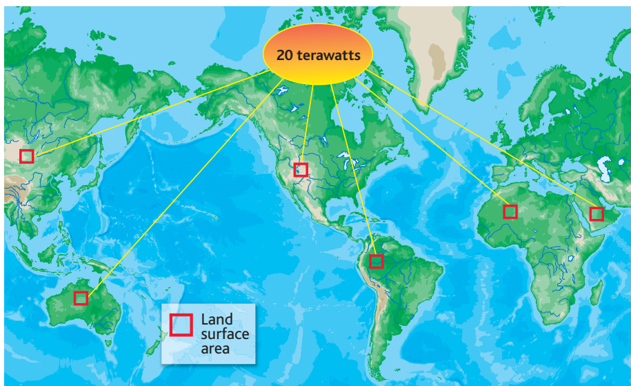
Global need. This map shows the amount of land needed to generate 20 TW with 10% efficient solar cells.

nearly one-third of which are reflected back into space. The bottom line is that every hour, Earth's surface receives more energy from the sun than humans use in a year.