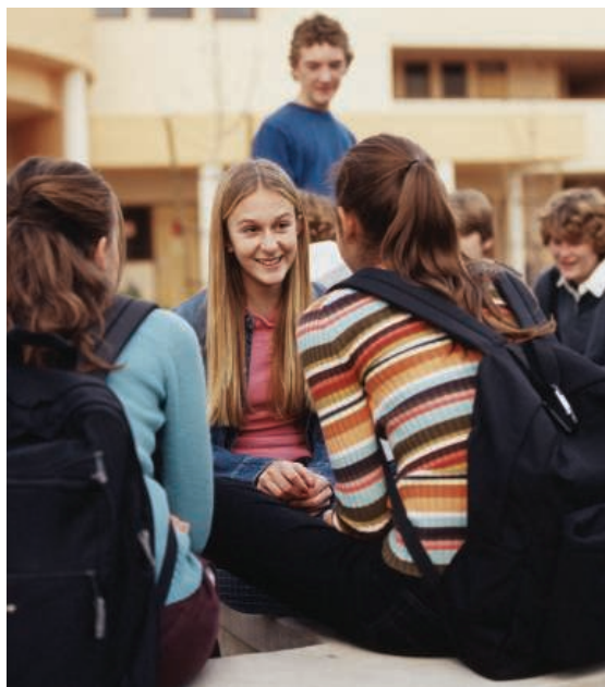
Are you ready? A protein called kisspeptin helps trigger the flood of hormones that marks puberty.