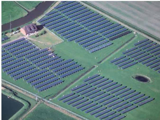
Fields of gold. Solar power is the most promising renewable energy source.

how much money is needed to reach those goals, but DOE officials have floated funding numbers of about $50 million a year. That's up from the $10 million to $13 million a year now being spent on basic solar energy research. But given the scale of the challenge in transforming the energy landscape, other researchers and politicians are calling for far more.